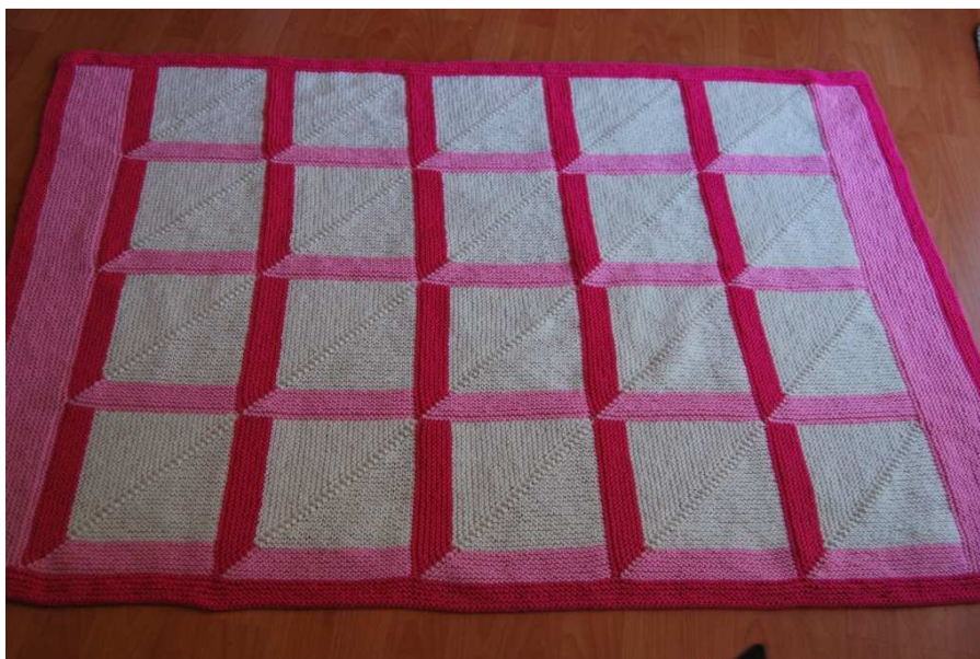
© Knitting Naturally - Depth Illusion Baby Blanket knitted in Garter Stitch

The knitting stitch pattern is a simple garter stitch (knit all rows). There is some shaping but you will not have to sew your blocks together - unless you really want to!