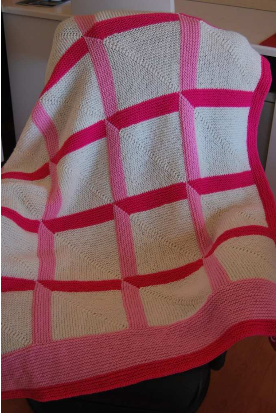
Depth Illusion Baby Blanket knitted in Garter Stitch

Try this pattern for my depth illusion baby blanket knitted in garter stitch. Although it is rated easy you will need to learn how to knit using two colours for the first 14 rows and how to pick up and knit stitches along the edges of your knitting.