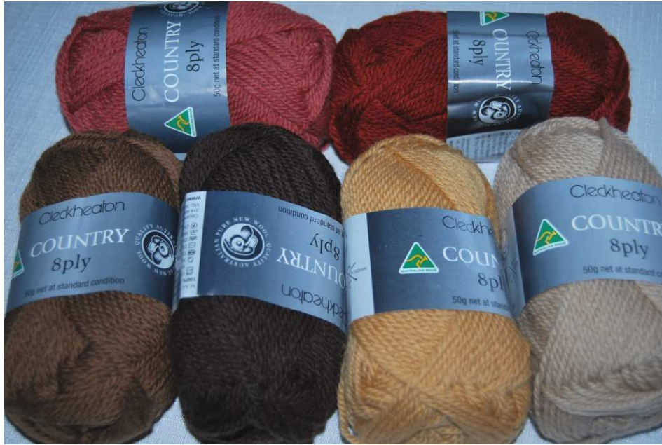
© Knitting Naturally - Materials for my Blanket

I have kept all of the dark wools in one row and used the lighter shades in each alternate row to try and create a shadow effect, which would work better if the colours were closer than they are.